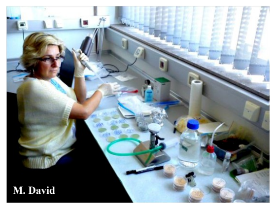
Preparation of samples to determine E. coli with Möller & Schmelz selective media

long incubation time for bacteria to grow to get the results as required by the D-2 standard (documented CFU). Having screened suitable bacteria detection methods, we note that the