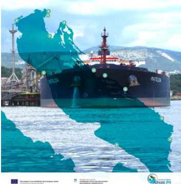
BALMAS Roll-up, upper part of the poster