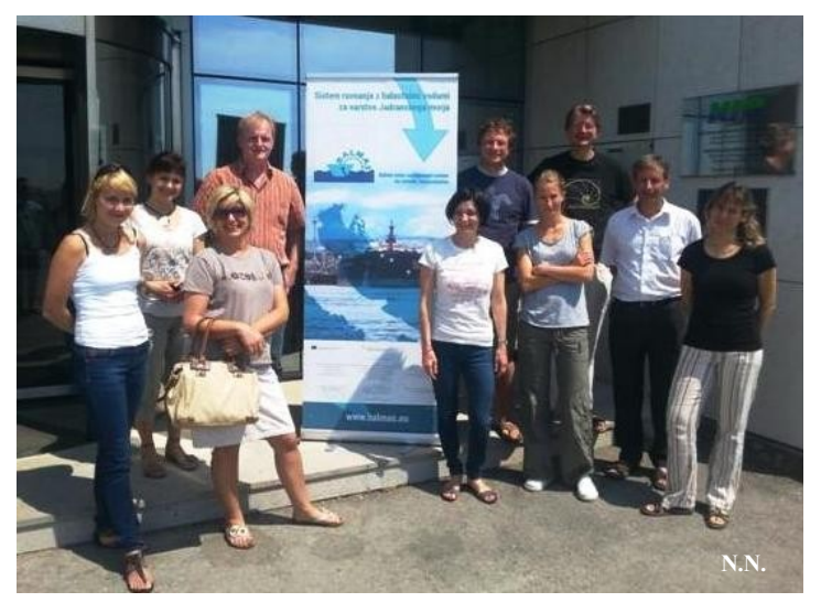
Participants of the workshop in front of the Marine Biology Station Piran, Slovenia

Adriatic Sea in the vicinity of the institute. For every series of tests four different algal cell concentrations were prepared, in addition to the natural sample, the sample was once diluted and twice concentrated, to obtain target concentrations of approxi-