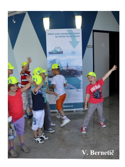
BALMAS Roll-up on exhibit for the World Oceans Day at Marine Biology Station Piran (NIB)

"Institute for Water of the Republic of Slovenia that coordinates 15 project partners from 5 countries is continuously monitoring the project progress"