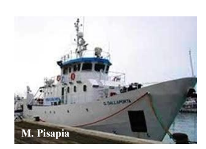
Research vessel G. Dallaporta CNR Italy

"The project is perceived as a tool to investigate the possible introduction or geographic spread of certain marine algae which are able to produce toxins.."