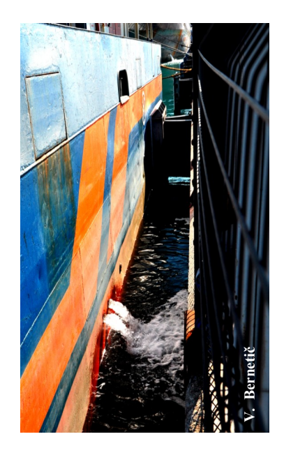
Cargo ship moored in the port area

"Institute for Water of the Republic of Slovenia that coordinates 15 project partners from 5 countries is continuously monitoring the project progress"